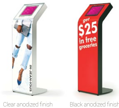
Clear anodized finish

AURA is one of the most attractive graphically customizable tablet display systems in the world. Whatever your tablet display goals, AURA will give you maximum exposure and flexibility. With its quick-change graphic panels, switching kiosk graphics is a breeze and its integrated back-light system gives your kiosk graphics maximum visibility and perfect lighting.